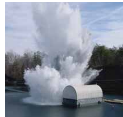
Heavy Weight Barge Testing (MIL-STD-901D)